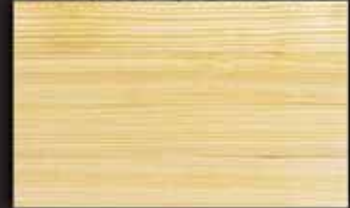
Vertical Grain Pine

Southern Yellow Pine Flooring Clear Grade Available Face widths 3-1/8" Pulled to Length 8' to 16' Vertical Grain