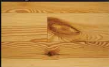
Longleaf Heart Pine

Old Growth Longleaf Pine Flooring - (75% or better Heart Content) #2 & Btr Grade - Mixed Grain - (Available Face widths - 3-1/8", 4-1/8", 5-1/8" & 6-7/8") - Special order 8-7/8" & 10-3/4" Pulled to Length 8' to 16'