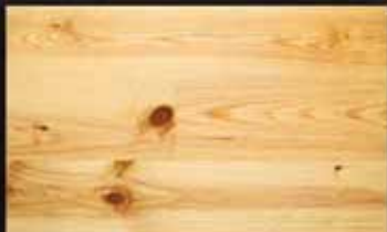
New Heart Pine

Southern Yellow Pine Flooring (60% or better Heart Content) #2 & Btr Grade - Mixed Grain - (Available Face widths 5-1/8") Special order 3-1/8" & 6-7/8" Pulled to Length 8' to 16' Nested (18" to 84")